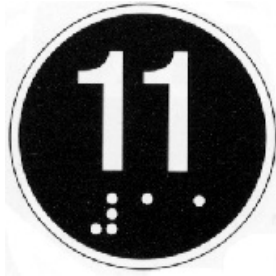
Part Number BDRC 1