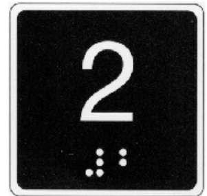
Part Number BDSC 1